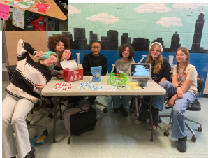
Restorative Practices Equity Team (not all pictured)