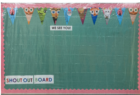
Shout Out Board waiting to be filled