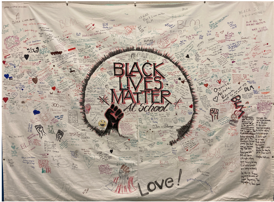
BLM 2024 Mural

ages to engage with critical issues of social justice. The intent is to implement racial justice into a lifetime of practice. This year's Week of Action was February 5-9. The national demands of the initiative include *end zero tolerance *mandate Black history and ethnic studies *hire more Black teachers and educational staff *fund counselors and not cops. Throughout the week the students were given the opportunity to collaborate on a BLM school mural project, learn more about the BLM Week of Action initiative during Advisory, participate in a celebration of Black culture through music and games created by Black creatives, and respond to the prompt "Black lives matter at school because...".