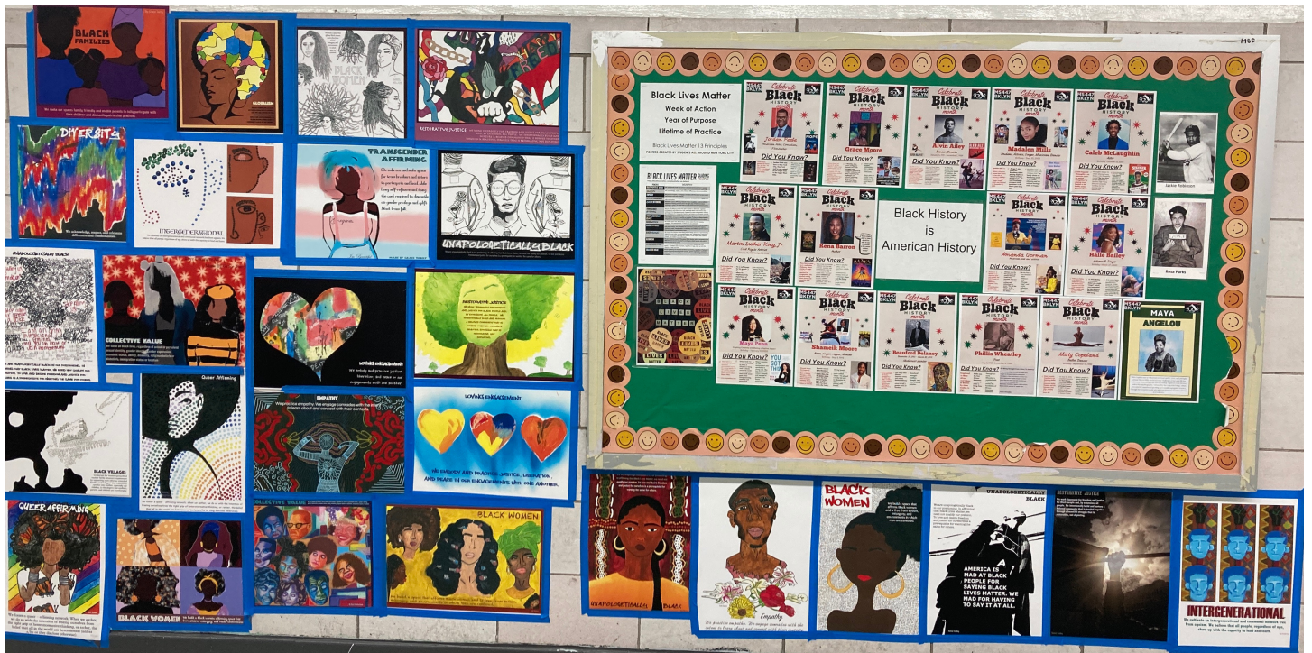
bulletin board designed by MS447 Student Equity Team - BLM 13 principles art: NYC students